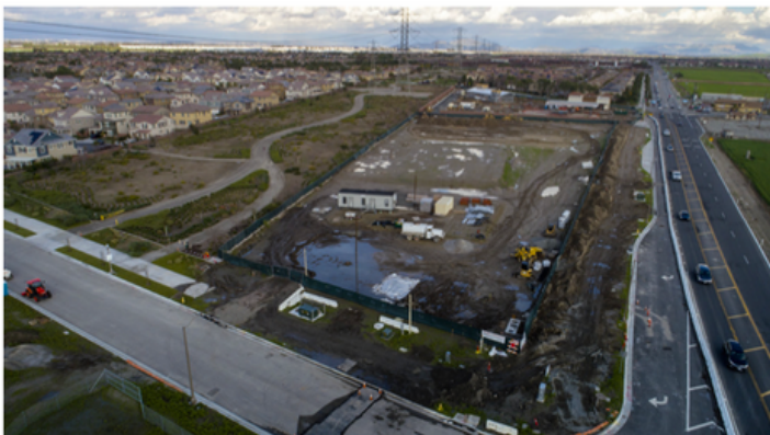
Early construction site of our new home in The Chino Preserve.